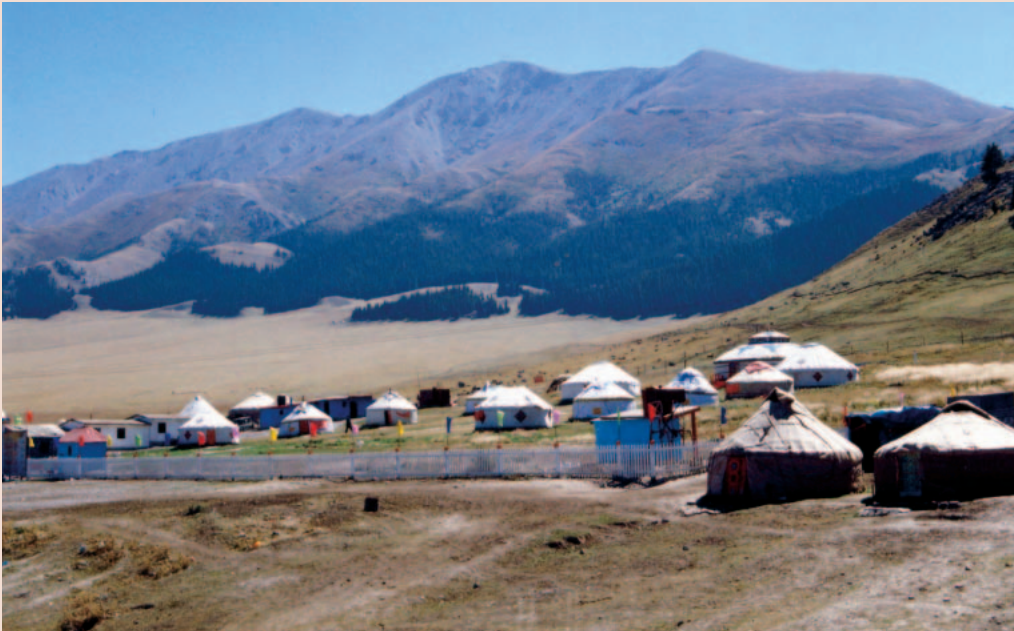
FIGURE 5 More sustainable tourist accommodations built by local people near Sayram Lake, in the Tien Shan; there are no permanent structures around the lake. Damage to the ground from tourist use can be repaired.

stand the significance of protecting world heritage sites and parks in mountains. Specialists, eg Xie Ninggao (Peking University) and Li Jisheng (Shandong Province), have revealed the problems of over-urbanization and landscape damage in mountains, and appealed for measures and actions to halt careless behavior. International pressure has forced some local governments to invest large sums to remove hotels and even local residents from scenic spots. In some areas, more sustainable tourism has been initiated (Figure 5).