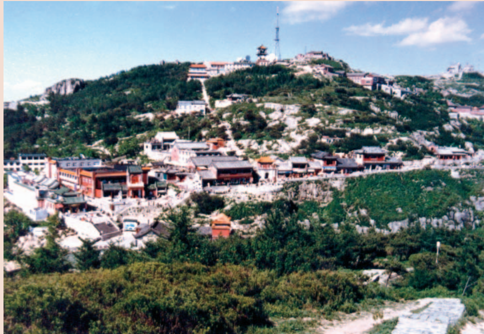
FIGURE 2 Sprawl of tourism facilities on the Yuhuang peak of Mt Taishan.

In recent years, average per capita income in China has increased rapidly, from about US$450–500 in 1990 to US$1000 in 2001, with peaks in cities and towns where many families now earn US$10,000 and more. People can therefore afford to travel within China and even abroad, especially during the 3 long holiday periods, also called the 3 golden weeks. Since 2000, holiday tourism has increased at a tremendous pace, leading to overcrowding (Figure 2). For example, Tibet recorded 686,000 tourists in 2001, 28.6 times more than in 1990. The Wulingyuan (Zhangjiajie) World Natural Heritage Site in Northwest Hunan Province—a typical tourist attraction—recorded 1.3 million tourists in 2002, compared with only 0.23 million in 1998 (Figure 3). Generally, the number of domestic tourists in mountain resorts has more than quadrupled in the last 5 years in China.