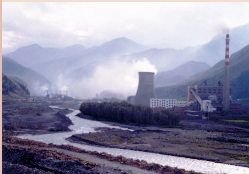
FIGURE 1 Cement plant built in the early 1970s in the mountains south of Urumqi, Xinjiang. The plant provided more than 300 local jobs but is the source of uncontrolled pollution. Distance from the city means there is lack of awareness of this negative impact.

The urbanization process has brought many problems. One is the emergence of landless peasants—a rapidly expanding and weak social group. Indeed, large-scale urbanization has led to confiscation of large areas of farmland. Although local governments have occasionally provided some compensation, the amount is usually very limited. In some cases, land was the farmers' only source of livelihood; they have become homeless, jobless and in some cases have lost hope. Another problem is the helplessness of many peasants who leave their home towns in search of casual labor in the cities, but with almost no assurance of income and decent health. These people are the victims of urbanization.