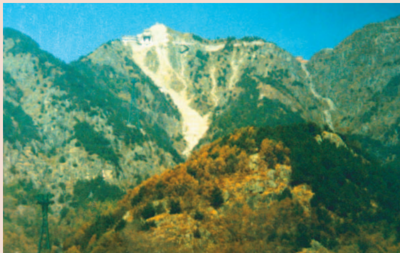
FIGURE 4 Scar (15,000 m 2 ) left by construction of a cable car on the Yueguan peak of Mt Taishan.

connected with the management of parks and heritage sites, with no clear aims and measures. Management of world heritage sites and parks is actually left to local governments which, in turn, usually rent them to tourist corporations.